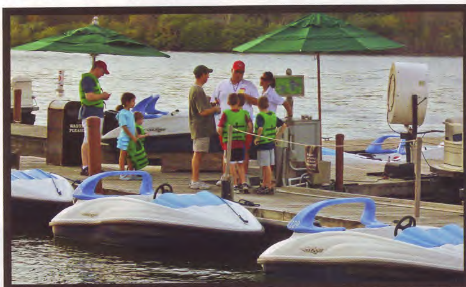
An almost endless supply of activities captivates guests throughout the Fort Wilderness Resort & Campground, from land to the water.

can be found at the Meadow Trading Post and at the Settlement Trading Post, just across from the marina.