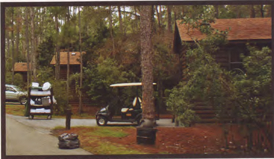
Fort Wilderness features 409 cabins within its 700 acres. One of the most popular and fun ways to get around the property is via golf cart.

Air-conditioned comfort stations are scattered throughout the campsites with restrooms, private showers, laundry facilities and ice dispensers. Basic groceries, camping supplies, movie rentals and even Disney merchandise