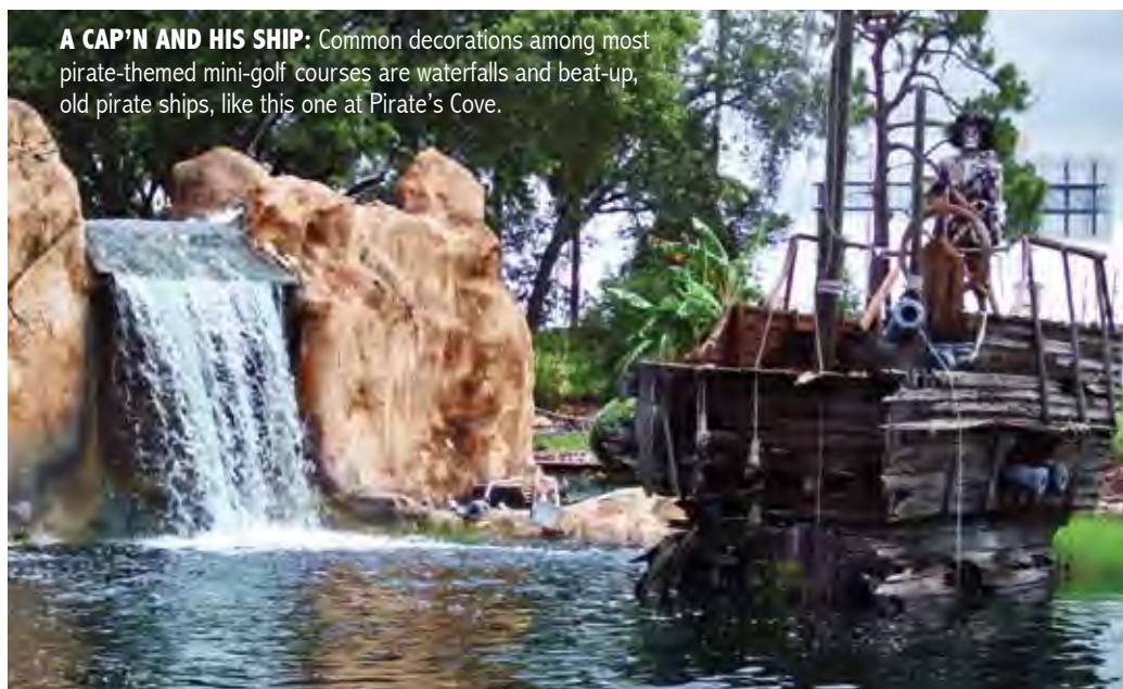
A CAP'N AND HIS SHIP: Common decorations among most pirate-themed mini-golf courses are waterfalls and beat-up, old pirate ships, like this one at Pirate's Cove.

“I think we've stayed popular for so long because we're at a great location and really stand