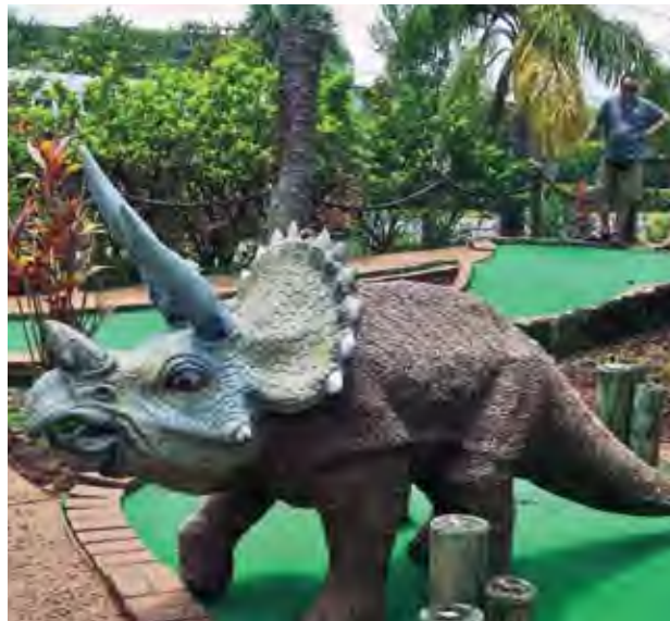
PREHISTORIC PUTT PUTT: Playing a round of miniature golf at Tiki Island Volcano Golf means having close encounters with a fire-spewing volcano and course-crossing dinosaurs.