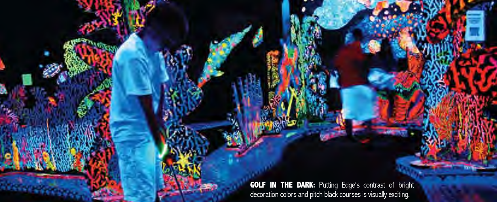
GOLF IN THE DARK: Putting Edge's contrast of bright decoration colors and pitch black courses is visually exciting.

vibe with music playing from the adjacent DJ booth, impromptu dance contests breaking out and an entryway game room featuring neon air hockey, skeeball and basketball. There are also two very cool and creepy private party rooms for rent, with dining areas straight out of an old-time haunted house movie, skull chandeliers and mirrors made from "bones."