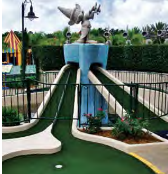
FANTASIA MEETS FAIRWAYS: Fantasia Gardens includes two distinct types of mini-golf courses, allowing for traditional as well as character-filled play.

Located in the Epcot resort area, Disney's Fantasia Gardens has two very different options.