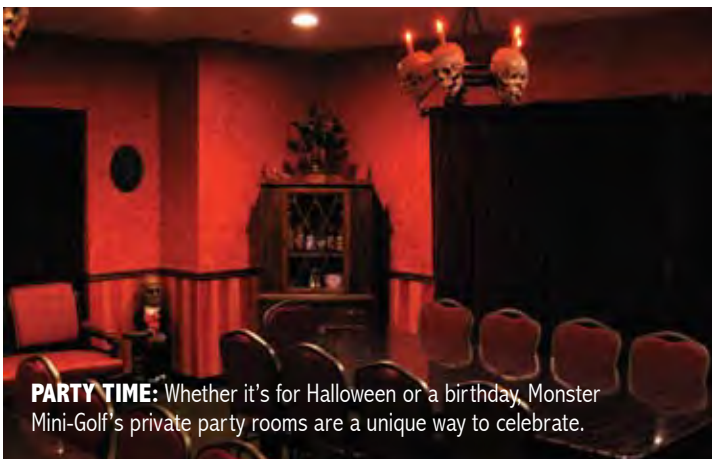
PARTY TIME: Whether it's for Halloween or a birthday, Monster Mini-Golf's private party rooms are a unique way to celebrate.

Business Center mall in Winter Garden, it is ghoulishly fun and worth the trip. The course is packed with glow-in-the-dark neon gargoyles, skeletons, ghosts, tombstones, aliens and even an oversized animatronic swamp monster. Plus the 18th hole features the thing that scares this writer the most – a giant scowling clown. Yet, the whole place has a family-friendly party