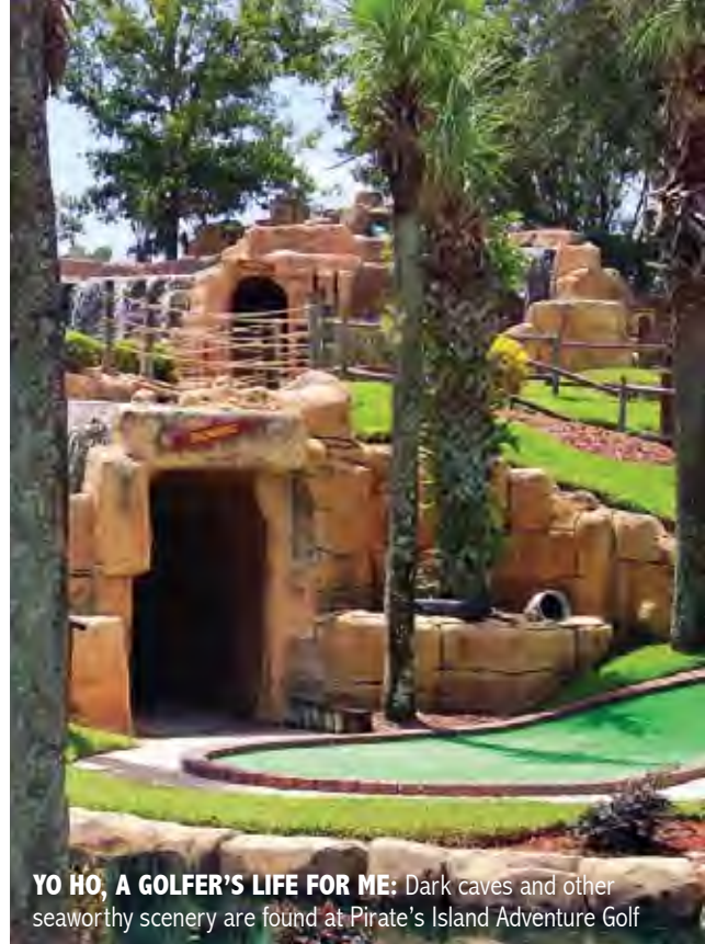
YO HO, A GOLFER'S LIFE FOR ME: Dark caves and other seaworthy scenery are found at Pirate's Island Adventure Golf

For family fun away from the parks, swing by one of the area's themed miniature golf courses.