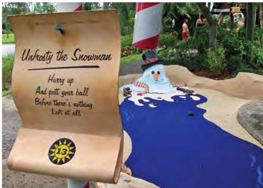
ALWAYS A HOLIDAY: Both of Winter Summerland's courses feature non-stop loops of Christmas music, perfect for getting stuck in your head.