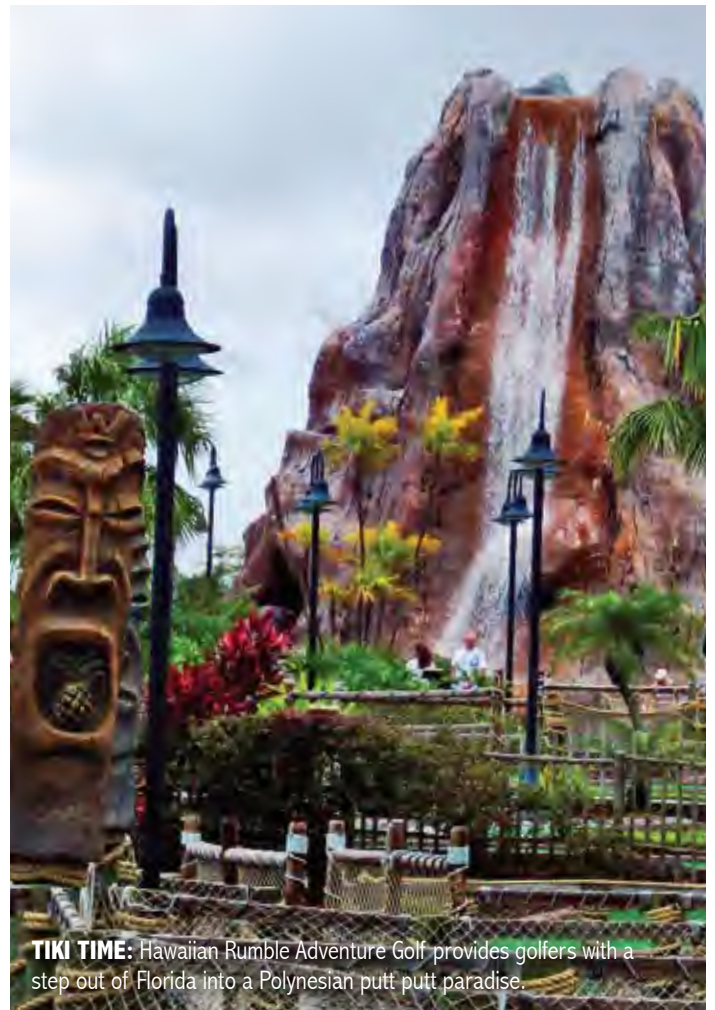
TIKI TIME: Hawaiian Rumble Adventure Golf provides golfers with a step out of Florida into a Polynesian putt putt paradise.

calm and pretty landscaping, waterfalls, streams, and courses named Lani and Kahuna, the International Drive location has more masks, tiki torches, and props. However, the volcano at the Apopka-Vineland location spouts fire every 10 minutes.