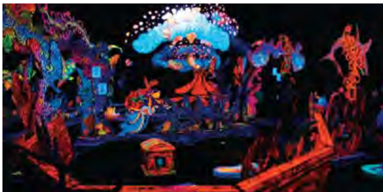
DEEPER AND DEEPER: At first glance, Putting Edge appears to be a tiny mini-golf course stuck within a shopping mall. But after playing a few holes, players realize there's a whole other back room filled with even more blacklight fun.